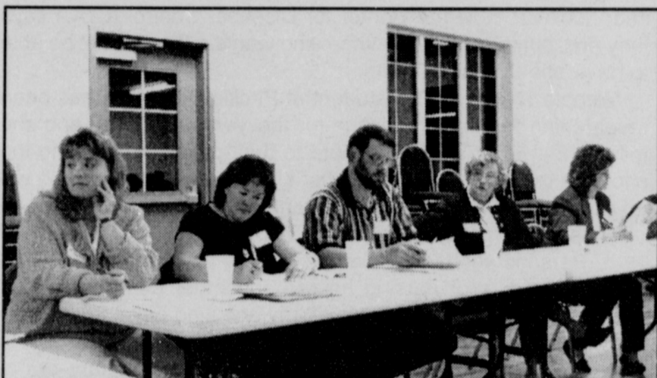
In addition to coffee and cookies, there was obviously food for thought at the first meeting of the Vernonia Business Assistance Team, Oct. 26.

Over coffee and cookies at the Scout Cabin, BAT members outlined their role in providing support services to local business owners, primarily by serving as a conduit to whatever resources they may need — help in developing a business plan, financial resources for start-up or expansion, instruction in computerized accounting, employee training and