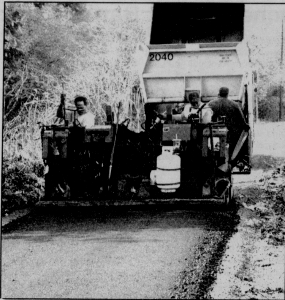
Paving of the Banks-Vernonia Linear Park extension from Anderson Park to Lake Vernonia went quickly and smoothly as the contractor, Chief Excavation, Inc., was able to take advantage of nearly perfect weather in late October. Trucks backed down the trail from the junction at the transfer station with each load of asphalt that was delivered.

Payments can be made at any branch of the St. Helens Federal Community Credit Union, all branches of Western Bank and the St. Helens branch of Bank of the West. However, if taxes are owed from previous years, payment cannot be taken by the banks.