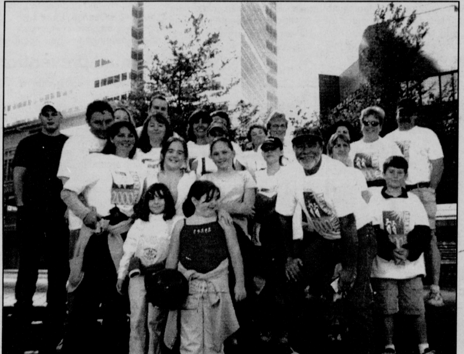
A contingent of Vernonia residents obviously enjoyed themselves when they participated in the Memory Walk to raise funds for services to patients of Alzheimer's Disease.