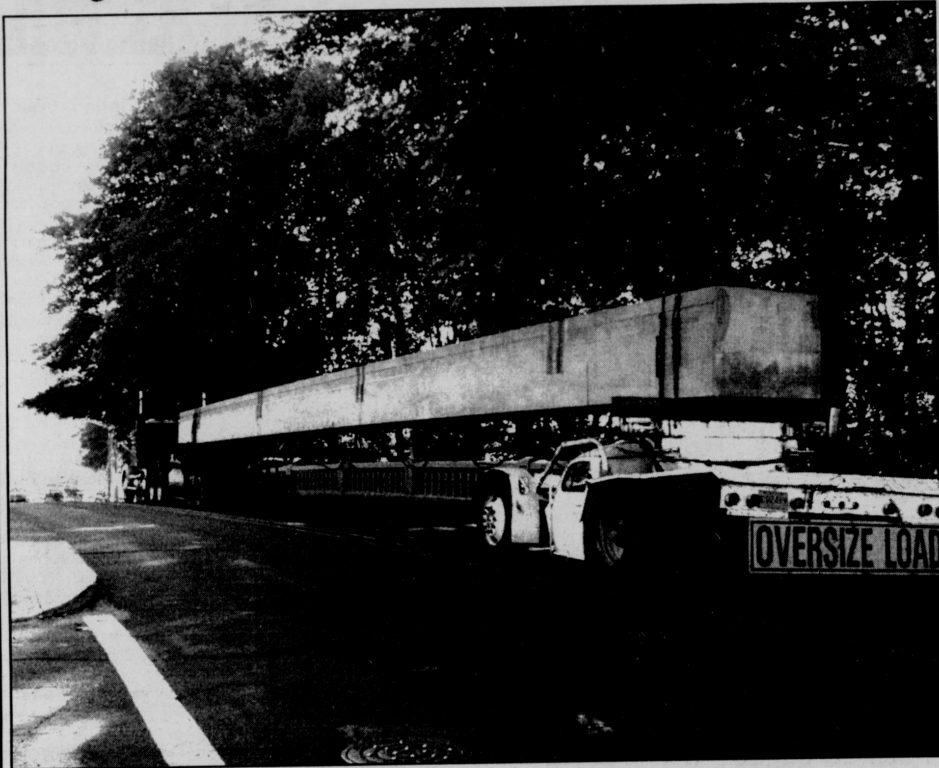
A bridge section on its way to Burris Road is about the same length as the span over Rock Creek in Vernonia.