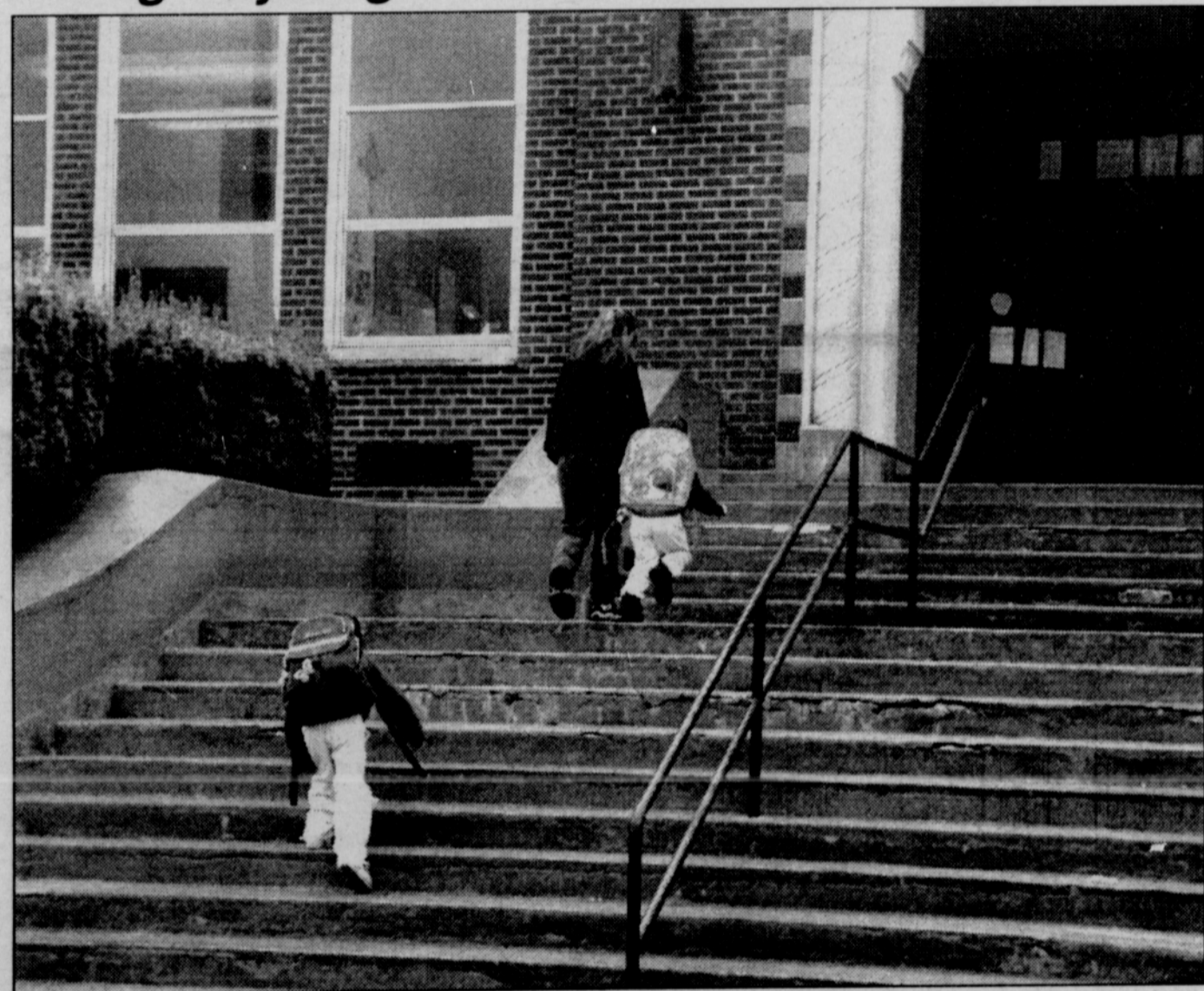
The steps are steep and the backpack is heavy on the first day of school. It sure is nice to have a helping hand from Mom.