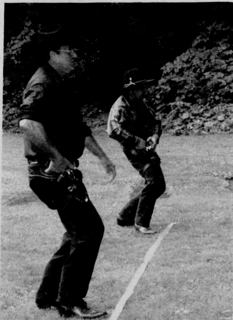
Two gunslingers shoot it out in fast draw competition.