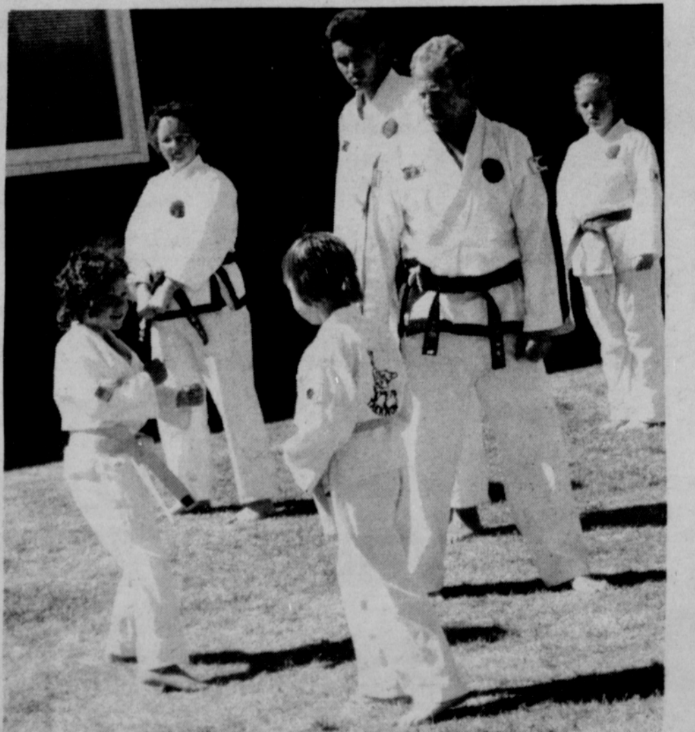
Students will display various levels of skills in taekwon-do during a demonstration on Sunday at 11:30 in front of VHS.