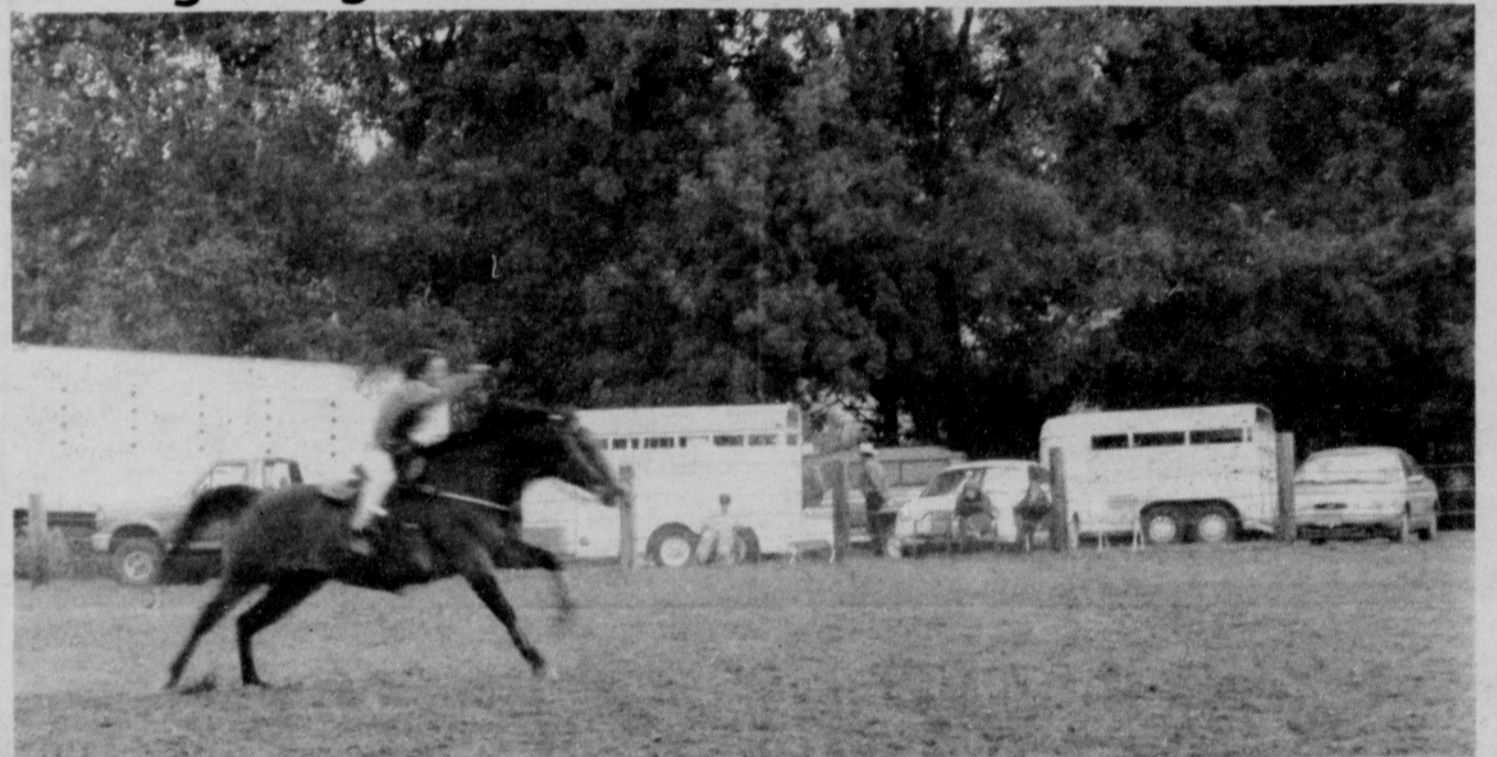
Horse and rider work together to make a good showing in horse gaming events.

The Vernonia Ridge Riders annual Jamboree Horse Show will be held on Sunday, August 6 at 9:00 a.m. in the Anderson Park Arena.