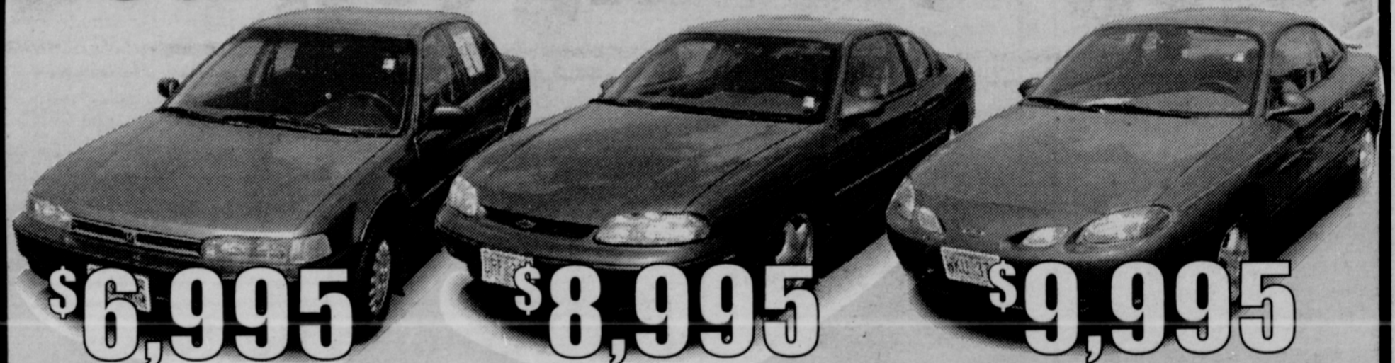
1993 Honda Accord DX Sedan

4 door, 4 cylinder 2.2 liter, automatic transmission, air conditioning, power steering, tilt, AM/FM stereo, cassette. #69657.