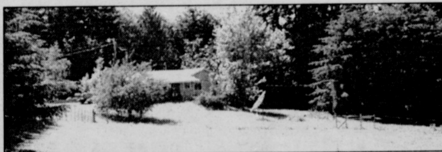
25615 NW Pihl Rd., Banks, Oregon 97106.....asking $339,500