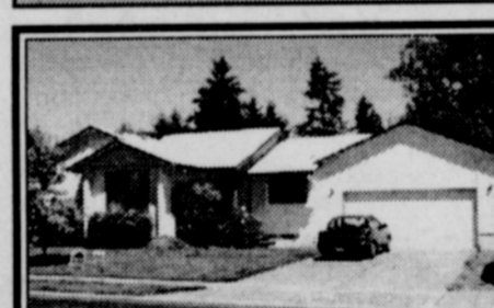
$119,950 - 1200 sf ranch, 2 bd, 2 ba, fireplace, maple cabinets, dbl gar. Drive by 1218 Heather Lane.

503-254-7500 Bohrer Realty 8844 SE Stark, Portland, OR 97216