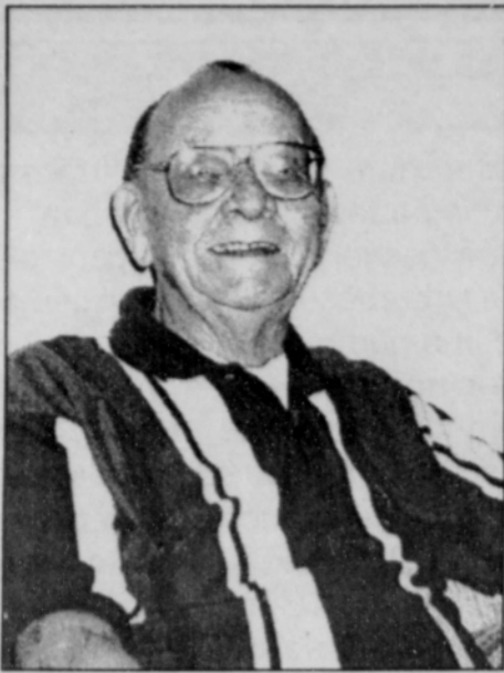
ART PARROW , Vernonia Mayor, retired school superintendent

"The most important happening in Vernonia during the past year was the preparation of the city for the new millennium. The renovation of the water distribution system saves most of the 40 percent of water that was lost through leaking pipes. Preparation also included the streetscape plan with new sidewalks, lights and trees; the construction of a new City Hall and library without using citizen property tax dollars;