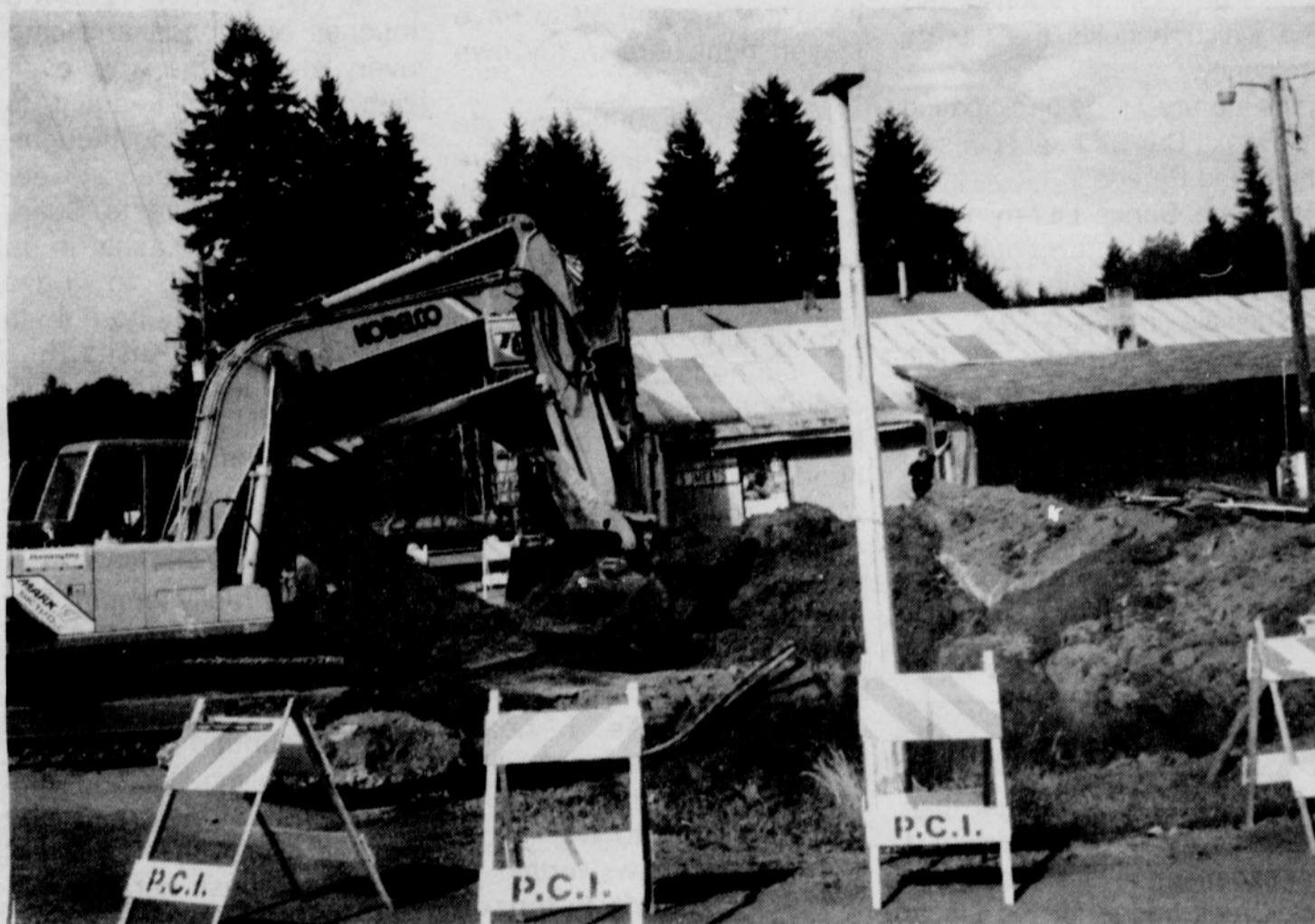
Removal of underground fuel tanks used when Sunnyside Service was a gas station has now been completed. Two of the tanks were partly under the building.