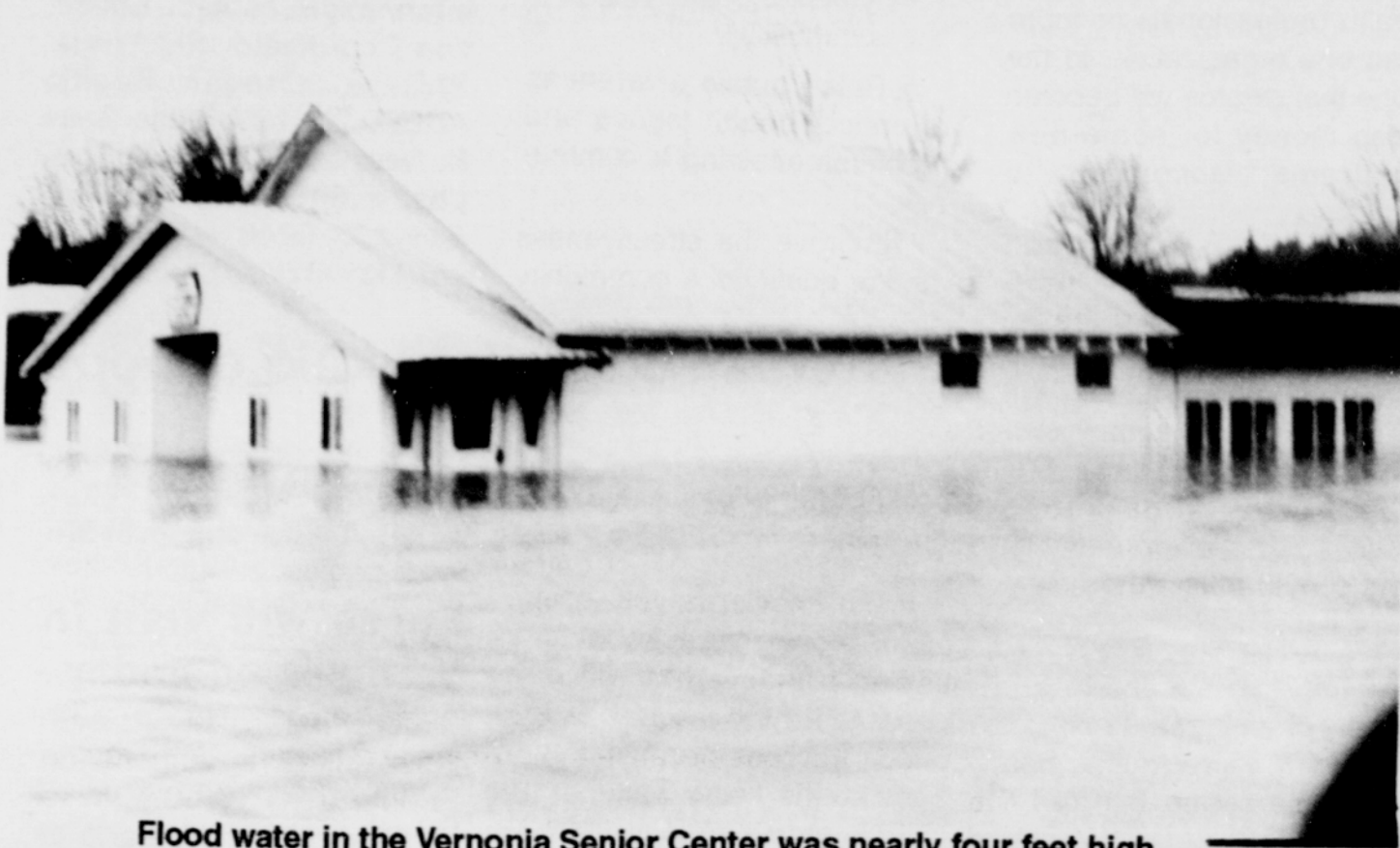
Flood water in the Vernonia Senior Center was nearly four feet high.