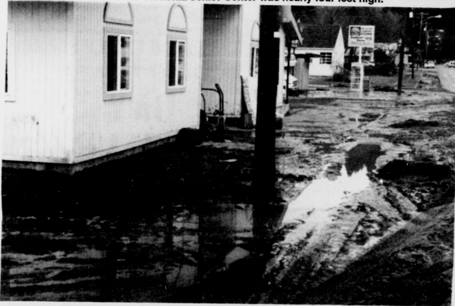
Receding flood water left a thick, slippery coating of mud all over town.