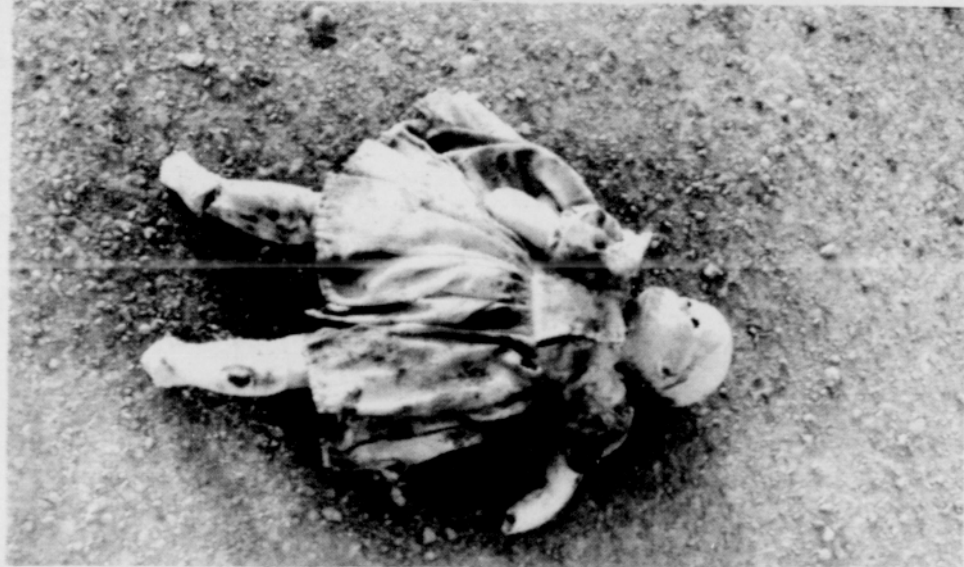
Flood victim — loved and lost.

"We hope our contributions will help ease the tremendous pain families are feeling. Although money can't adequately deal with the loss of personal possessions, keepsakes, and damaged homes, it may help people recover from one of this region's worst catastrophes."