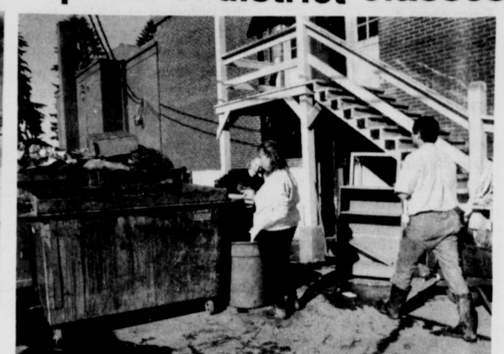
School. Others were kept busy sanitizing those items that were washable.