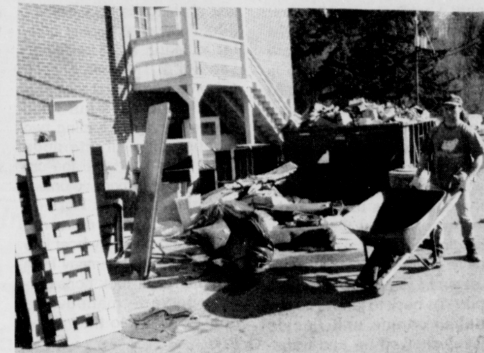
Lots of muscle was provided by volunteers to haul flood-ruined debris from the basement of Washington Grade

The school district has not yet decided whether to run double shifts or to hold class during the scheduled spring vacation. The school board will meet tonight, Feb. 21, at Lincoln Grade School for a further update.