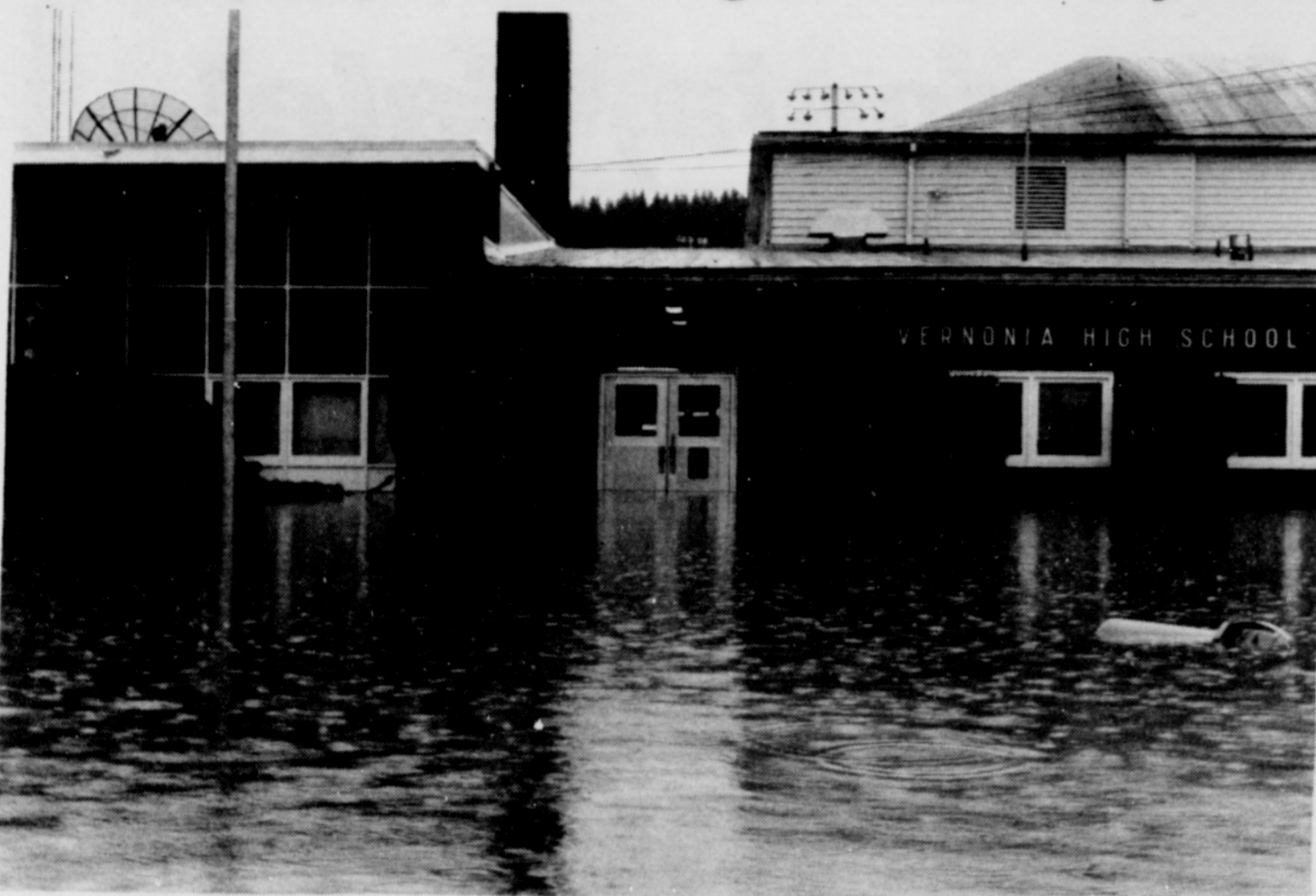
Above: Flood water continued to rise after this photo was taken. Top right: Wet vacs, disinfectant and rubber gloves were in great demand. Bottom right: Remains of the VHS shop. Below: Three busloads of Gaston students spent a day helping clean up VHS.