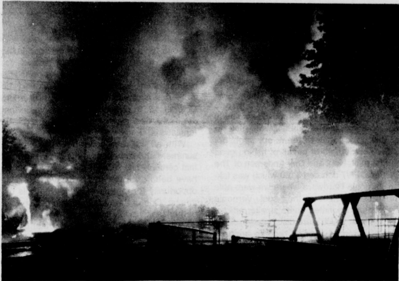
Flames lit the night sky for blocks as a shed filled with most of a family's belongings burned to the ground.