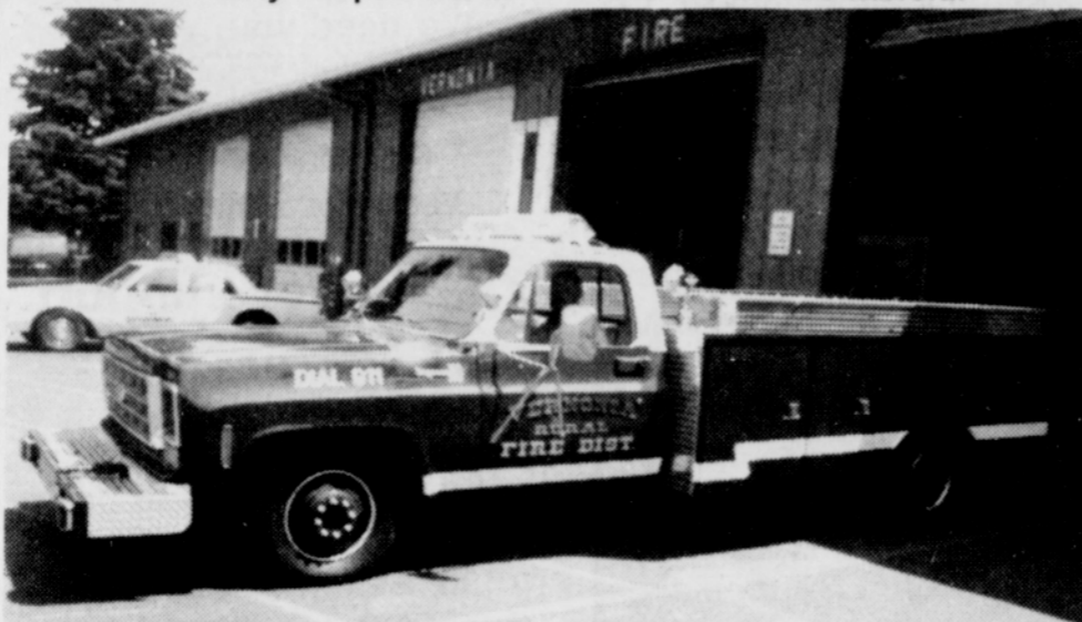
A new first response foam and rescue unit for the Vernonia Rural Fire District utilizes the chassis of an old ambulance.

For special situations during Vernonia's annual Friendship Jamboree, see the Vernonia Jamboree tabloid.