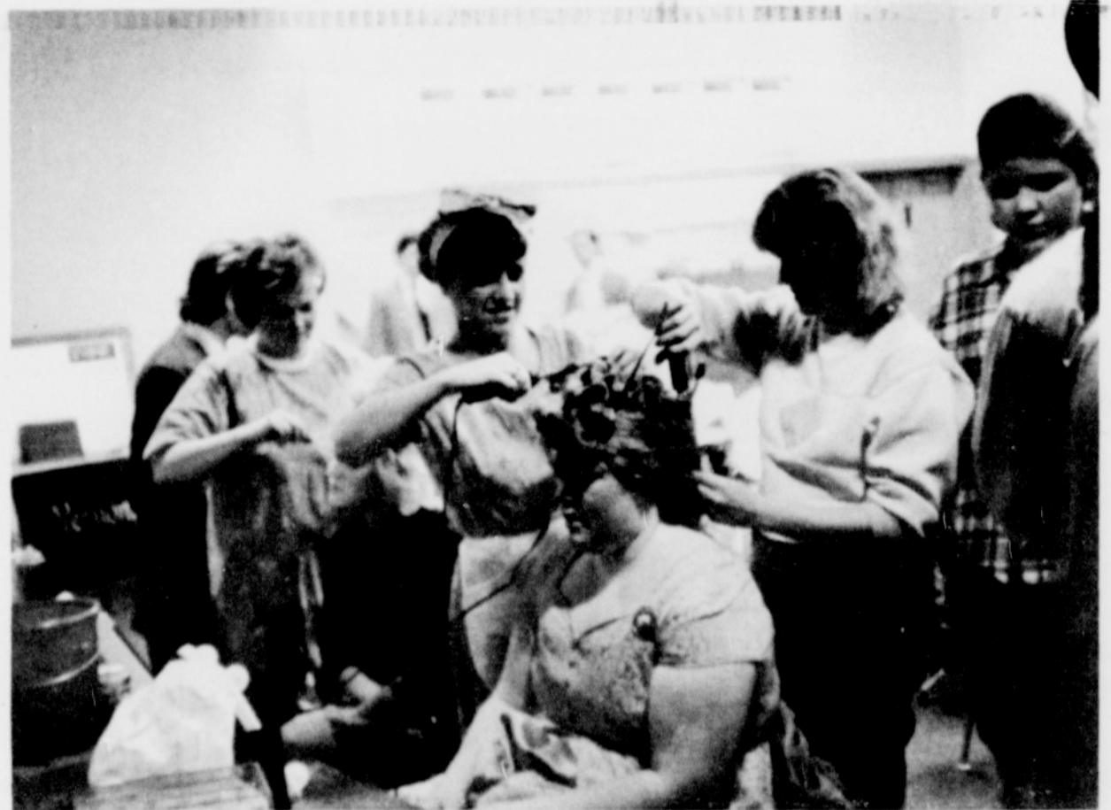
Hustle and bustle of backstage isn't apparent once the performers step on stage.

Anyone interested in the development of a local theater group is invited to attend the meeting.