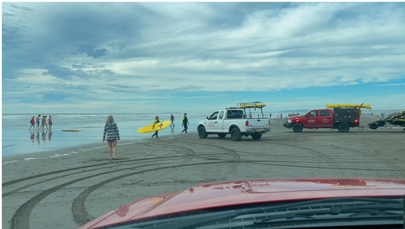
Seaside Fire and Rescue