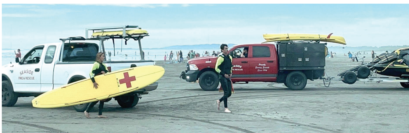
Seaside Fire and Rescue