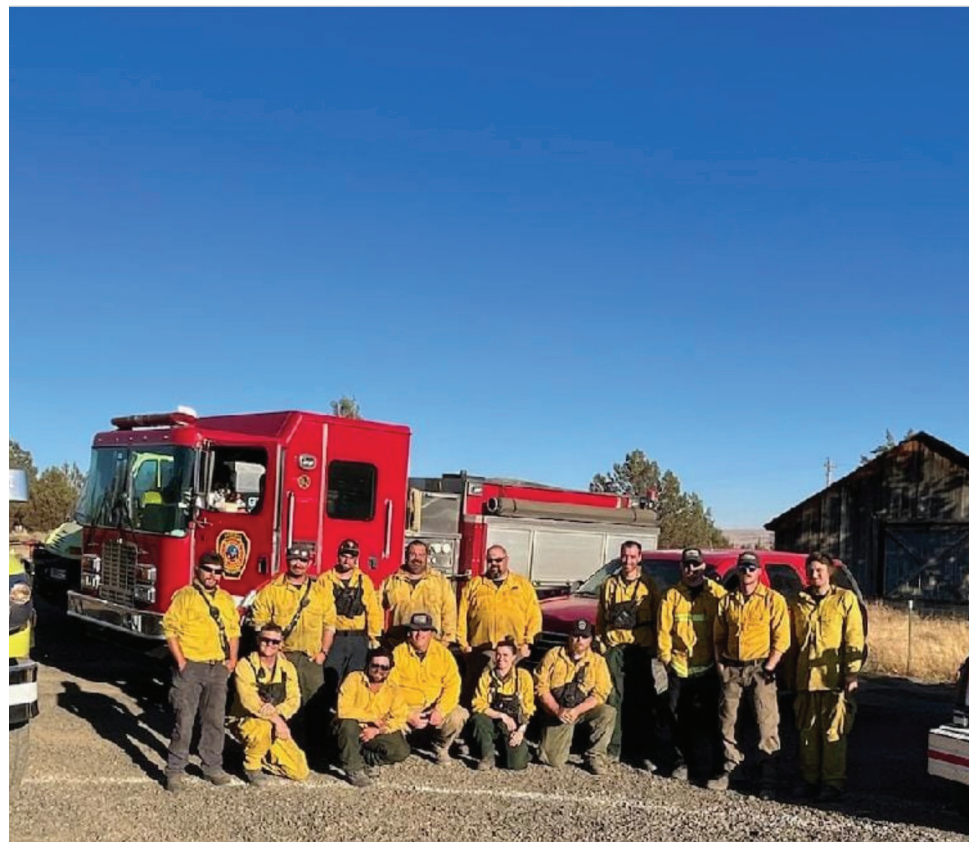
Gearhart firefighters returned from fighting the Miller Road Fire in Wasco County.