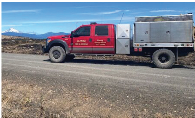
Seaside provided mutual aid response to the Miller Road Fire. Teams returned on Saturday.