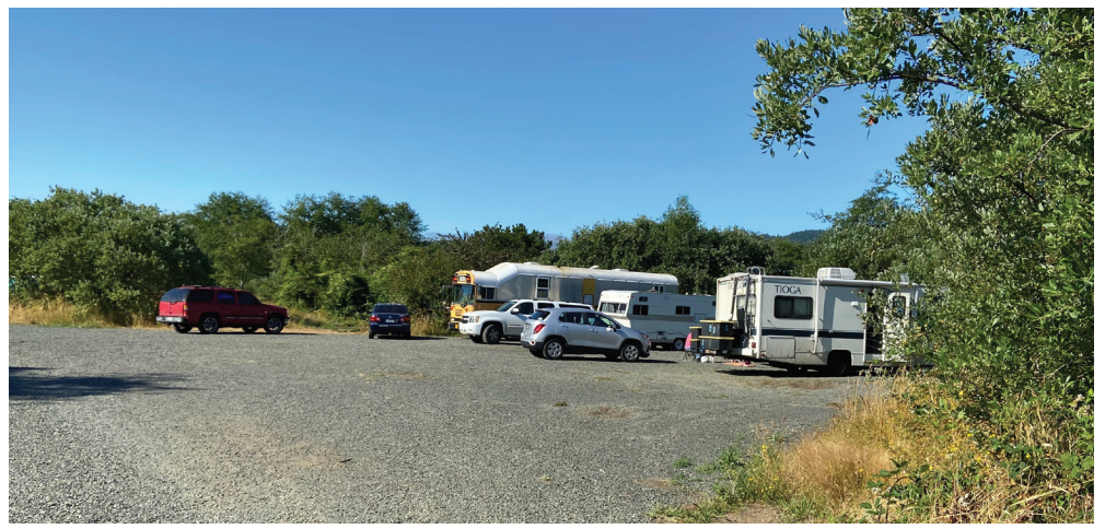
RVs and campers at the city's camping area off Alder Mill Avenue.