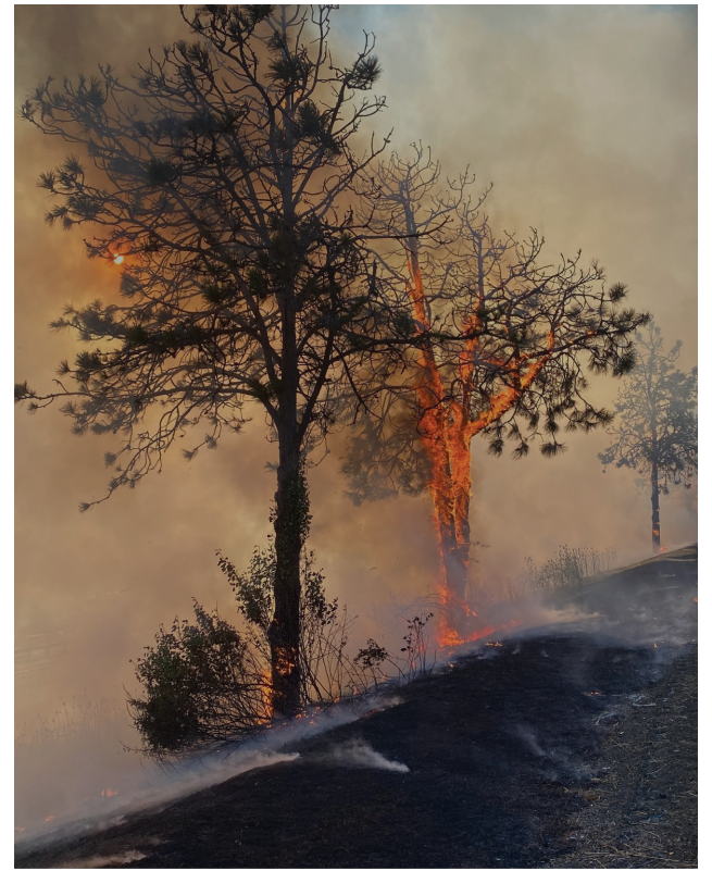
Oregon Department of Forestry

For public restrictions, levels move from low (green), to extreme (red). These are indicated on the fire information boards at major roads entering forested areas. Campfires will be allowed at campsites: designated sites and at dispersed sites in low (green). This recognizes that attended campfires adjacent to campsites have a low incident of spread. As conditions dry out, the move to moderate (blue)