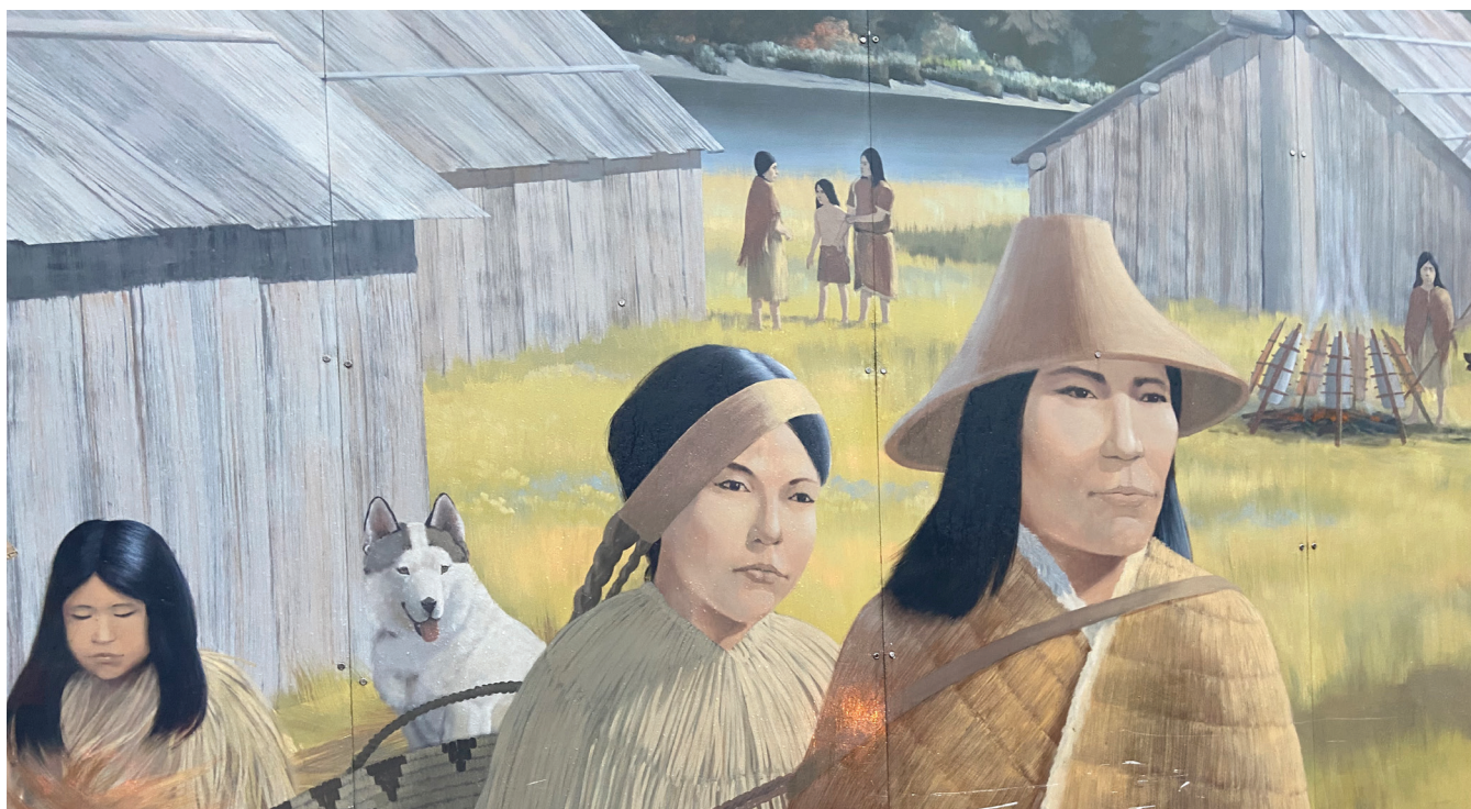
Section of the Native American mural.

ODOT work starts in the fall and continues into 2024. When it begins, there will be both day and night work with shoulder and lane closures. Lane closures will be at night, 7 p.m. to 7 a.m., Sunday through Friday, when needed.