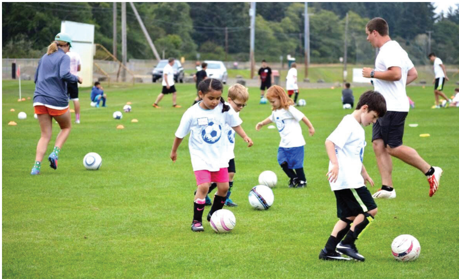
Young soccer players enjoy a past Lower Columbia Youth Soccer Association summer camp.

For more information, email lcsacamps@gmail.com or go to the organization's website: lcsasoccer.com .