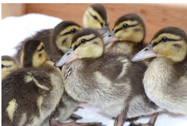
Birds of a Feather spring festival takes place May 14 and May 15.

In 2019, Marlantes turned in a different direction with his novel, "Deep River," about the logging industry, canneries and labor