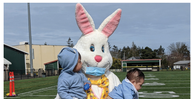
Sunset Empire Park and Recreation District

Astoria and Seaside meet again Monday at Gearhart Golf Links.