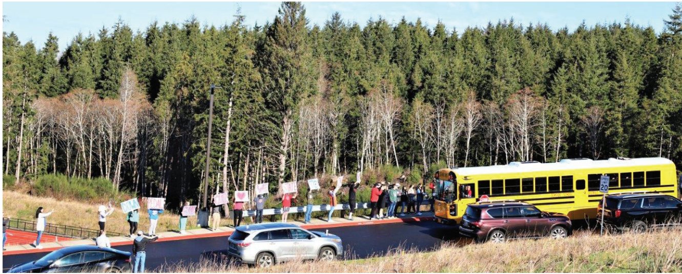
Students give a royal send-off to the Gulls as they headed to the state tournament last Wednesday.