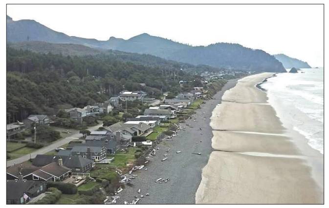
Aerial view of Cannon Beach.

And those stories are not unique to city staff. Just 5.5% of workers in Cannon Beach live in the city, and