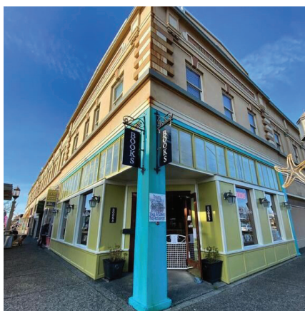
Beach Books, along with Lucy’s Books in Astoria, are one of two bookstores to participate in the Assistance League program.

The donations will help teachers build their personal libraries in class-