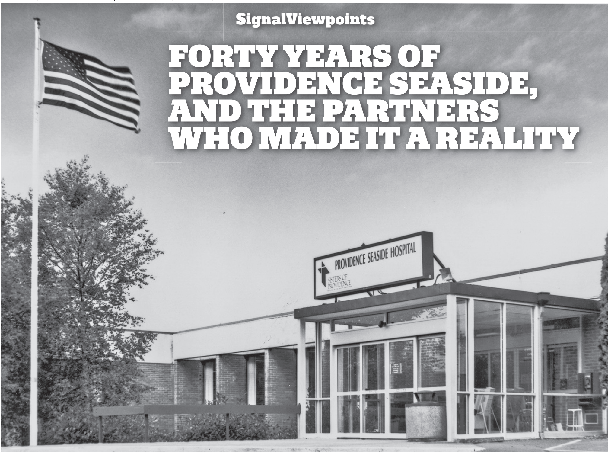
Providence Seaside Hospital