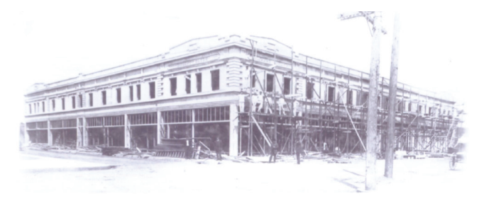
Gilbert Inn Hotel

Gilbert Block Hotel at the time of construction.