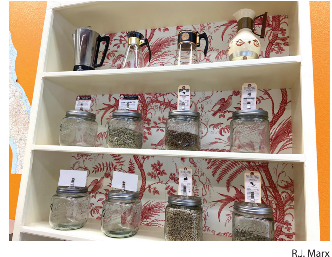
Visitors will have the chance to buy roasted beans or to roast their own.

Along with local coffee aficionados, Boone is aiming for visitors who want a rainy weather activity, or want to celebrate a special occasion. "It could say something as simple as 'happy birthday'