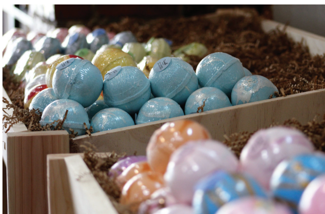
Katherine Lacaze Creative stylings at Beach Soap and Candle on North Holladay Drive.

Over time, she has expanded her inventory to include a myriad of other personal care and wellness products, as well as candles,