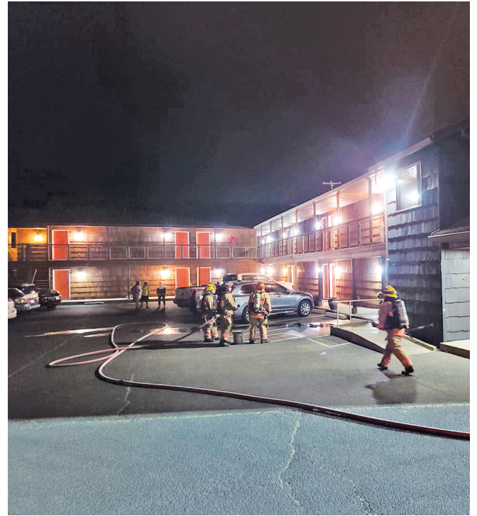
Seaside Fire extinguished a second-floor deck fire.

very slowly when a driver came from behind and rear-ended another. That vehicle then went forward and rear-ended another.