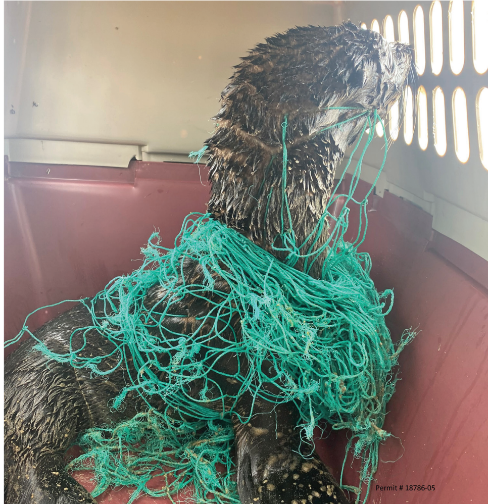
The fur seal will be taken to a rehab facility for a health assesment and detanglement.

In lieu of flowers you may make a contribution in coach’s name to: Seaside Scholarships, Seaside Kids Inc. or a charity of your choice.