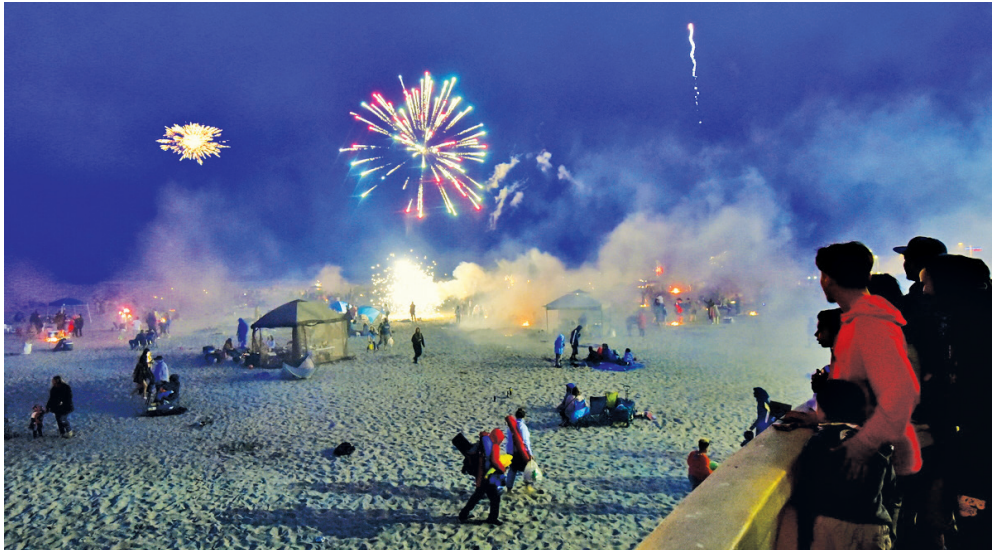
Despite no sanctioned show, fireworks lit up the sky near the Turnaround in Seaside.

The cart was recovered Monday after being found parked in the dune trees off the 400 block of North Ocean. It sustained some minor damage but still runs,