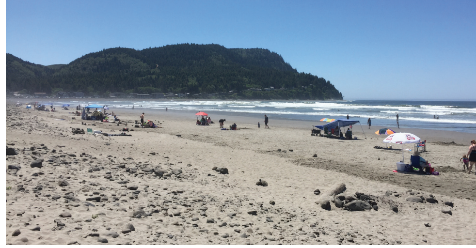
Families beat the heat at Avenue U beach last Saturday.

Seaside had put into place an emergency order in March of 2020, early in the pandemic, restricting access to all public buildings, city parks and the beach. The resolution