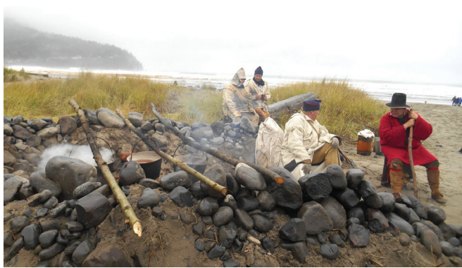
Seaside Museum and Historical Society

The Seaside Visitors Bureau and Tourism Advisory Committee awarded $16,900 in grant funding