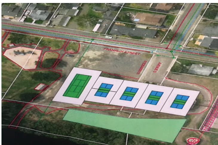
Preliminary proposal for a tennis court and four pickleball courts at Cartwright Park.