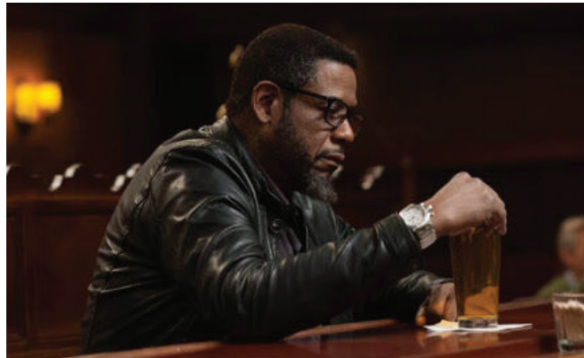
LEFT: Forest Whitaker plays a journalist in "City of Lies." RIGHT: Johnny Depp plays a detective in the movie.