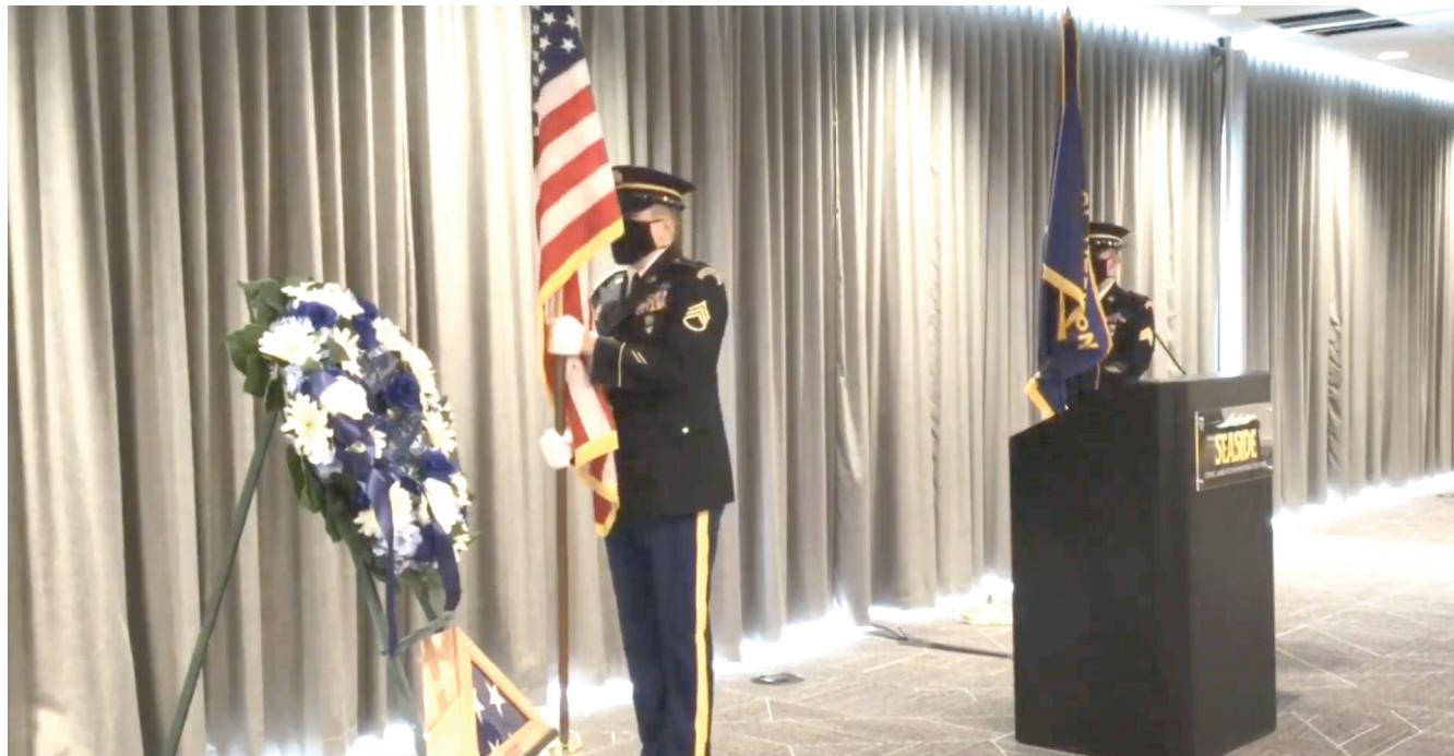
Seaside Police Department

McCrary moved to Monmouth to attend Western