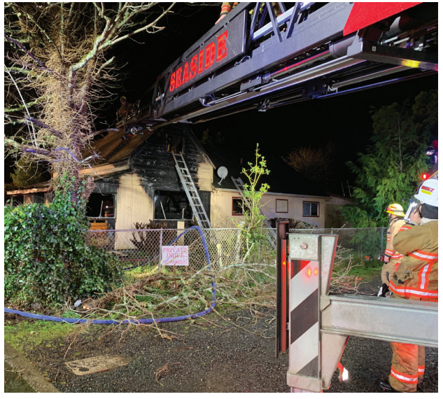
City of Seaside