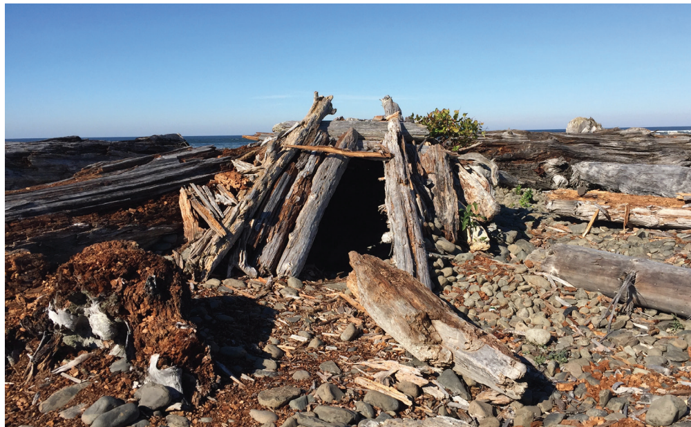
A makeshift shelter in the Cove.

“You cannot solve a situation in a vacuum,” Montero said. “You cannot solve it without the input of the people experiencing it. We really