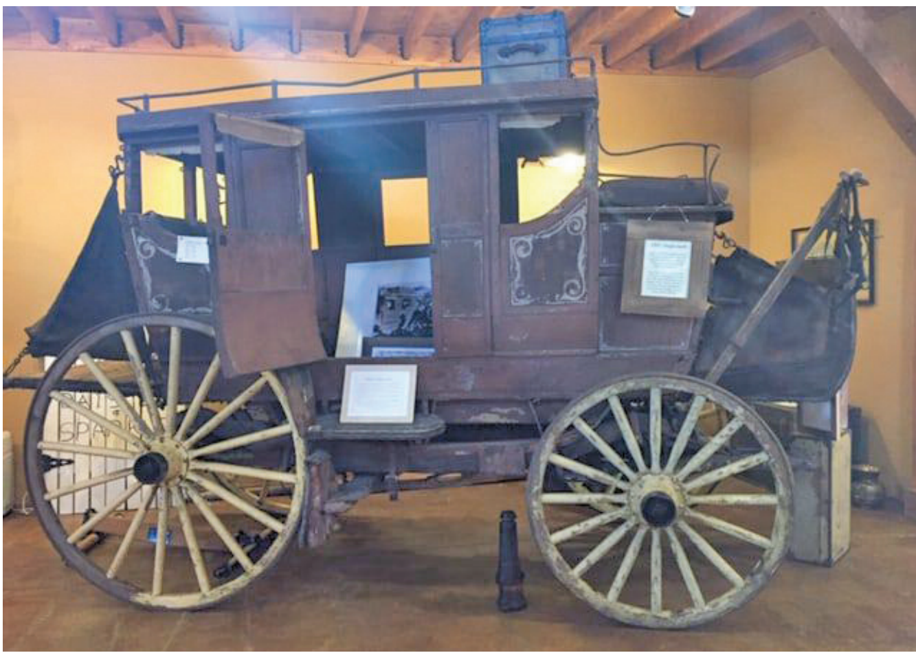
An 1888 stagecoach at the Northwest Carriage Museum.