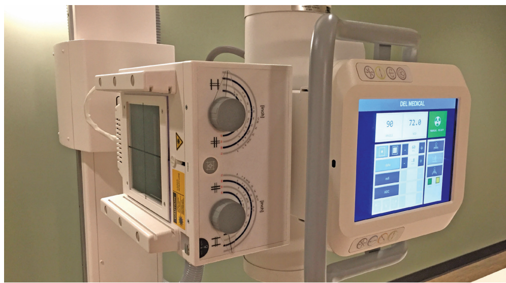
X-ray equipment at the CMH urgent care clinic.