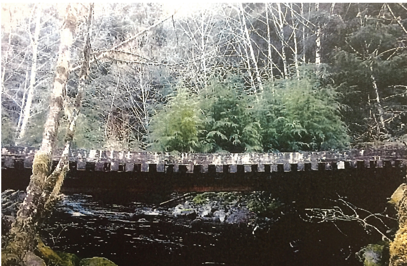
One of the logging road bridges in need of repair in Seaside's watershed.