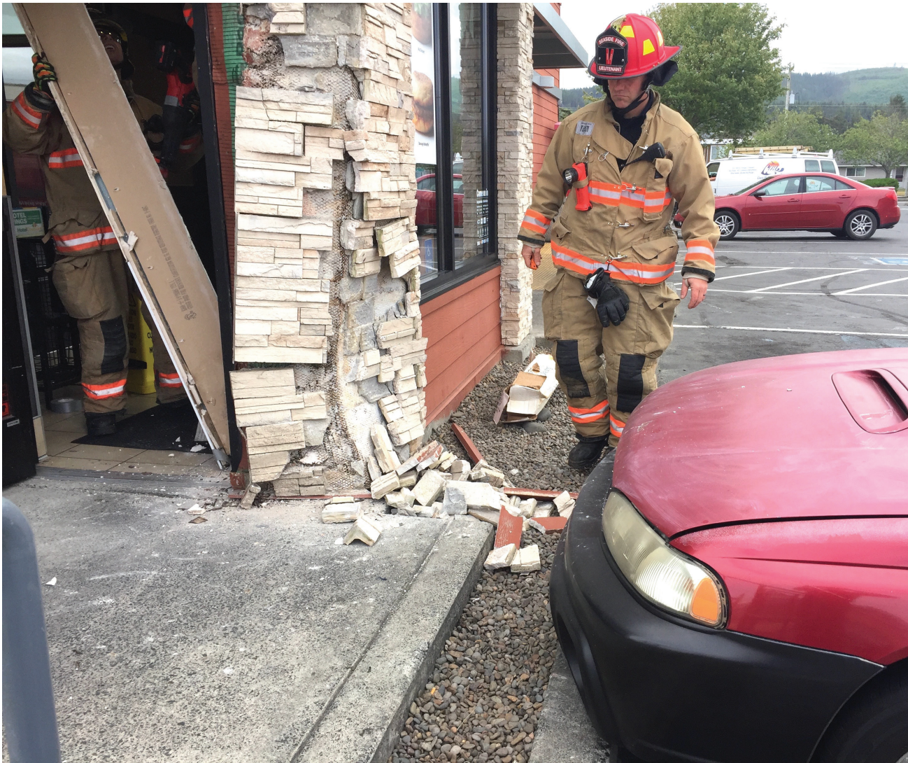
A Seaside firefighter responds after a Subaru crashed into McDonald's in Seaside.