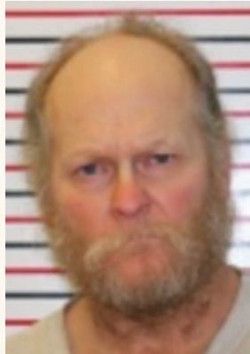
Clatsop County Sheriff