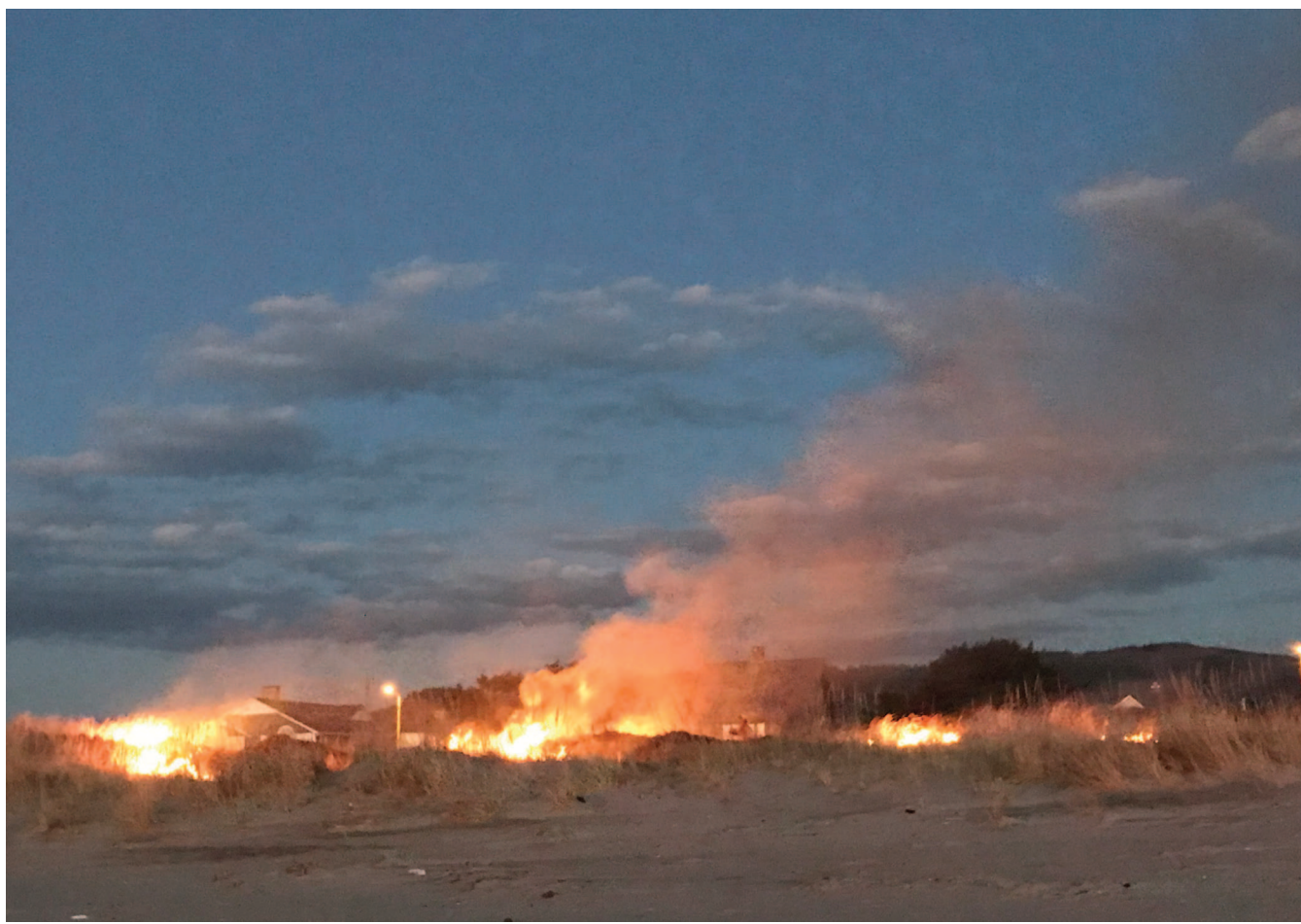
City of Seaside

The investigation continues into the felony elude of a police officer and reckless driving. The case will be forwarded to the Clatsop County District Attorney's office for review.