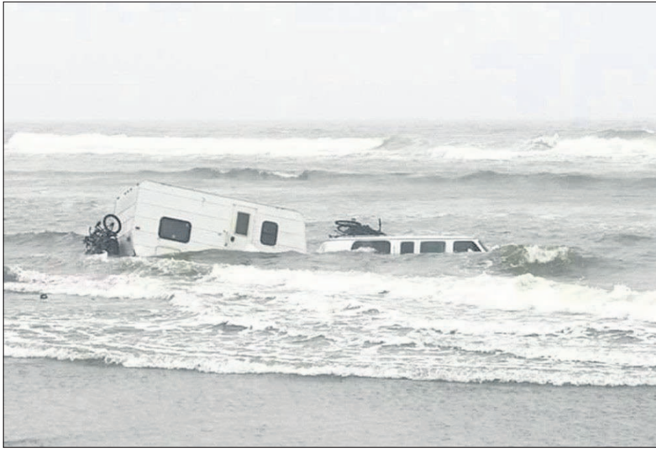
A van and trailer got stuck in the surf around 4:30 a.m. Aug. 22 near Gearhart.