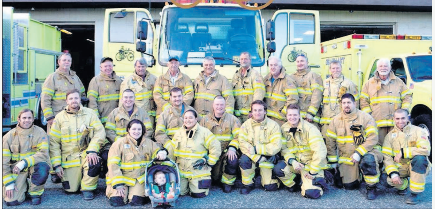
Members of the Gearhart Fire Department.

1992 — State keeps Gearhart beach from 10th Street