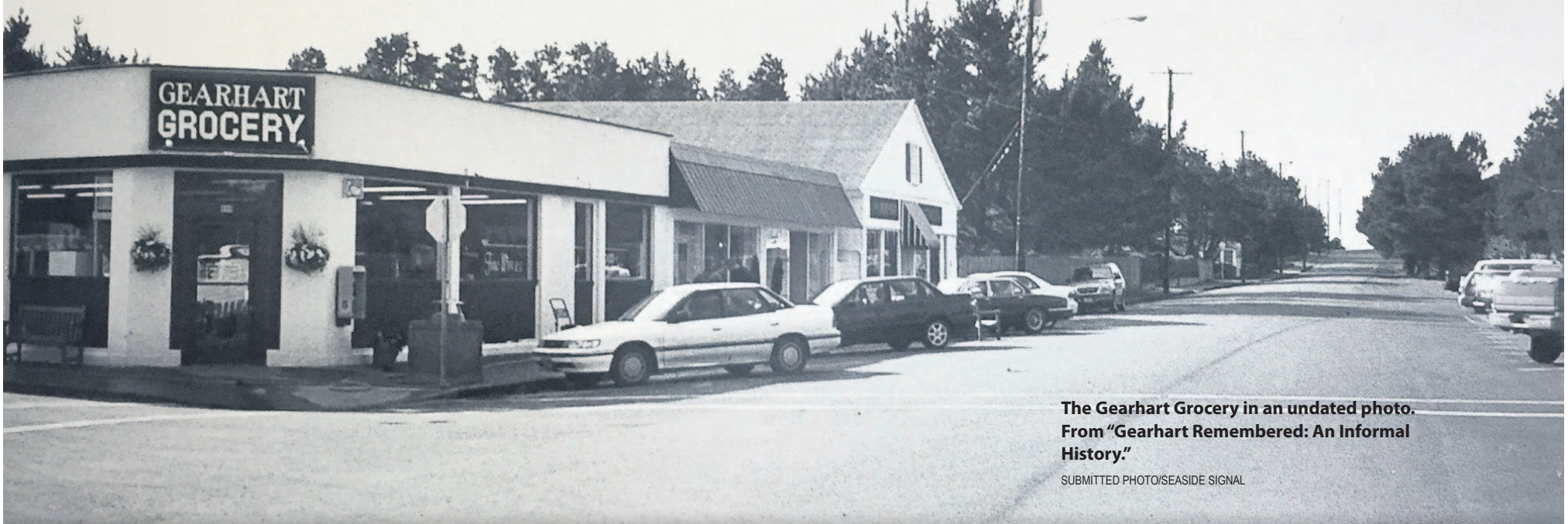
The Gearhart Grocery in an undated photo.