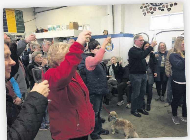
Gearhart residents raise a toast to the next 100 years.

2018 — Gearhart celebrates 100th anniversary with a year of centennial events.