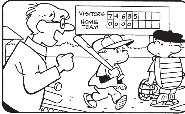
Find at least six differences in details between panels.