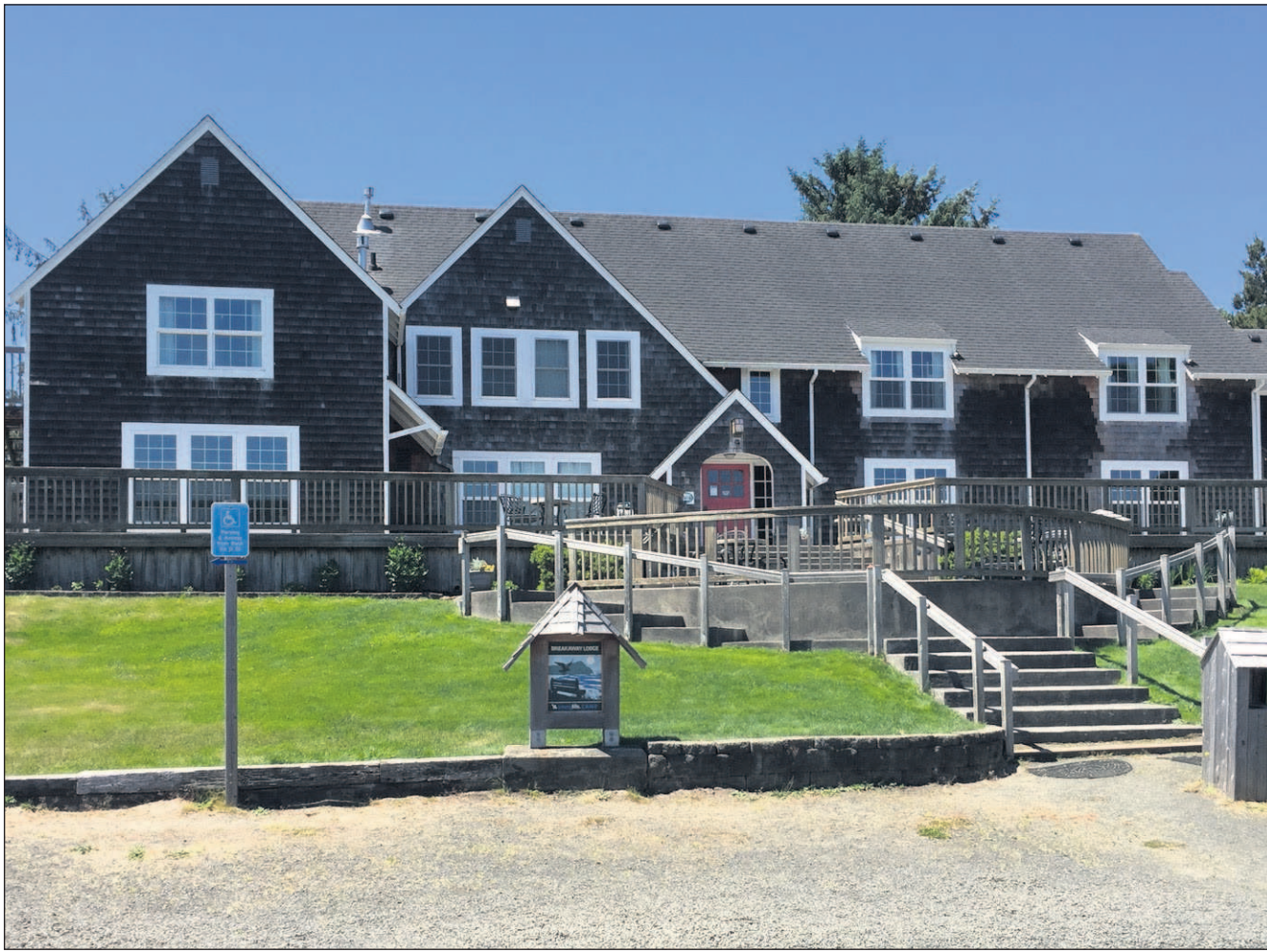
Breakaway Lodge in Gearhart.