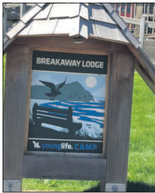
Breakaway Lodge in Gearhart.

"Many of the Holy Names sisters were teachers around the state and would come for 10-day retreats in the sum-