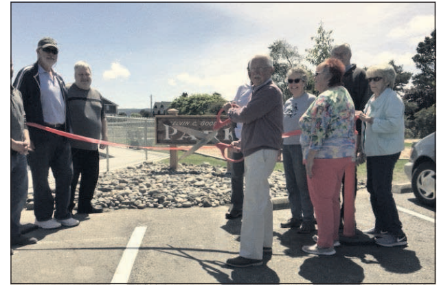
Members of the city council and parks committee at the ribbon-cutting at Goodman Park.