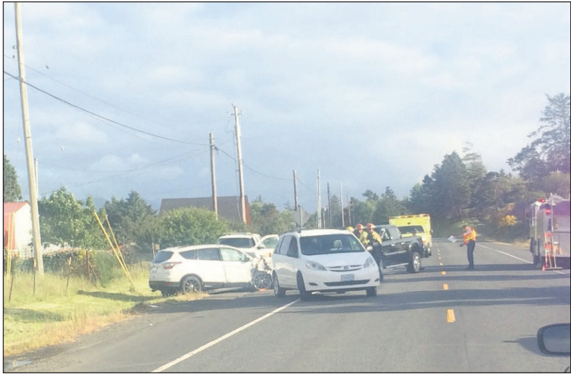
A man was killed and two injured in a head-on collision that closed U.S. Highway 101 near Gearhart.