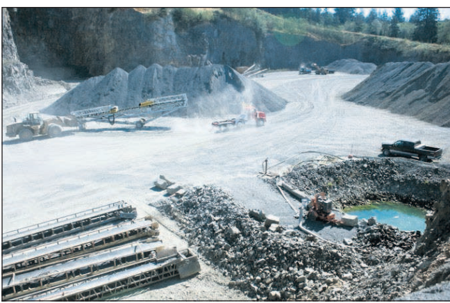
THE DAILY ASTORIAN

Knife River, one of the largest construction material producers in the United States,