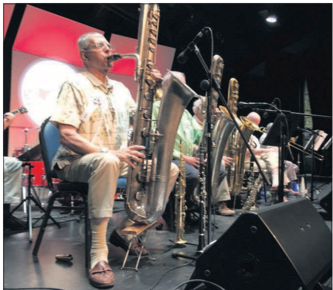
Members of Uptown Lowdown pull out the heavy artillery: three bass saxophones, rarely seen onstage.