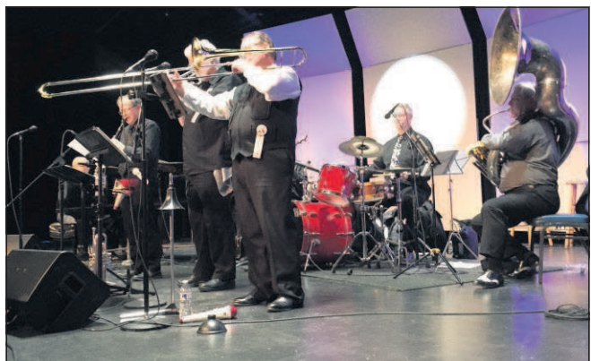
Black Swan at the Seaside Jazz Festival.

The music extended through Sunday, with a gospel concert at the convention center and a performance by the Seaside High School Jazz Band.