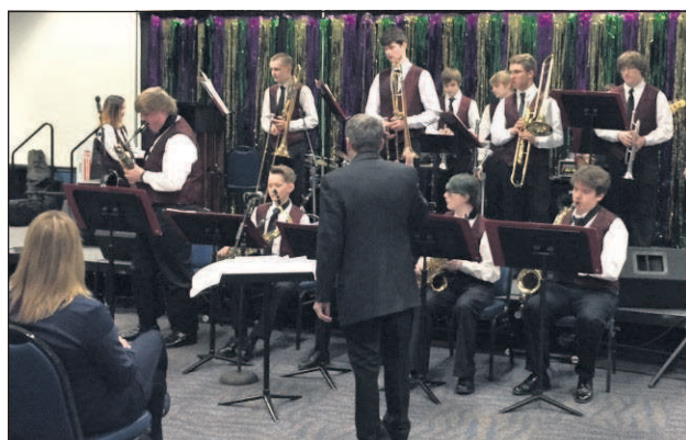
Student musicians onstage at the jazz festival.