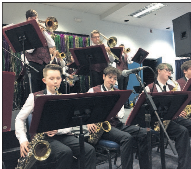
Seaside High School Jazz Band performs at the Seaside Jazz Festival.

Money raised by the Lighthouse Jazz Society, organizers of the festival, also provided scholarship funds to musicians seeking to attend jazz camp in Washington state this summer.