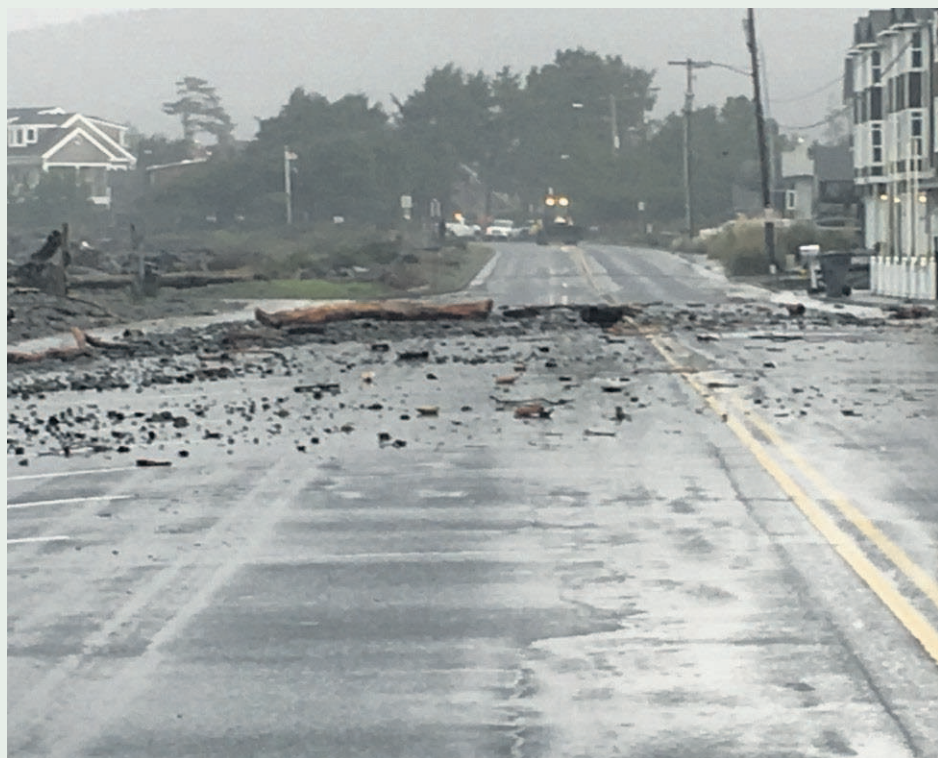
Flooding in the parking lot by the Cove.